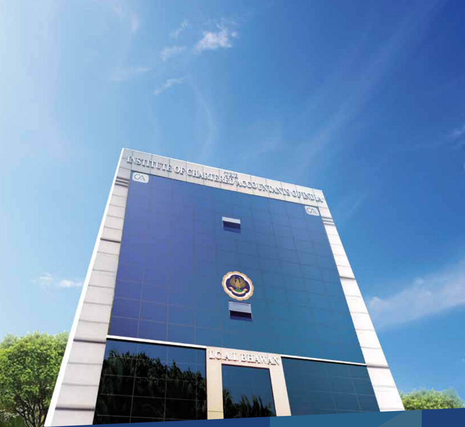
ICAI Bhawan, New Delhi