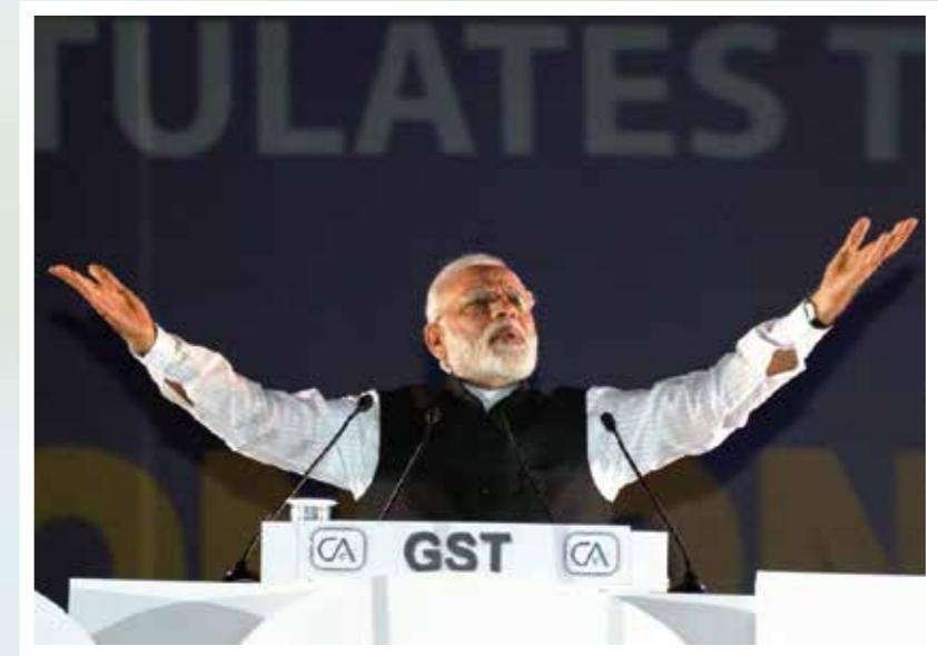
Honorable Prime Minister of India Shri. Narendra Modi delivers a power packed, insightful address on 68th foundation day of The Institute of Chartered Accountants of India

“We wish the participating organisations and candidates all the best.”